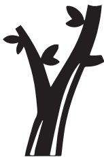
BRANCH COLLECTION CALENDAR 2025

Other than on Otterburn Park's branch collection days, residents can dispose of their branches at the regional ecocentre, at 60 Fisher Street, Mont-Saint-Hilaire.